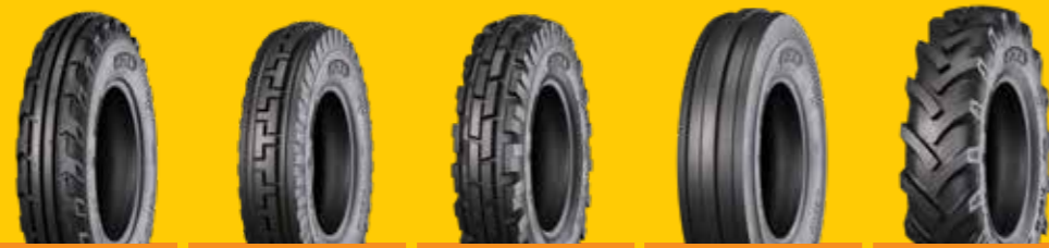
KNK30 KNK32 KNK33 KNK35 KNK50