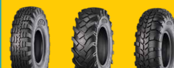
KNK10 KNK12 KNK14