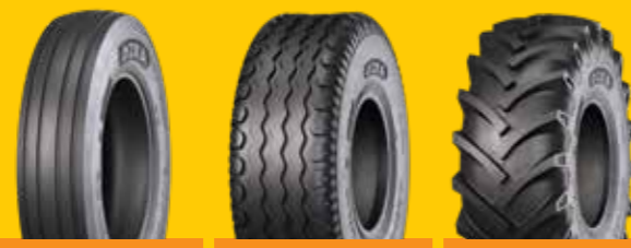
KNK36 KNK48 KNK50