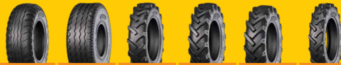
KNK42 KNK48 KNK50 KNK52 KNK54 KNK140