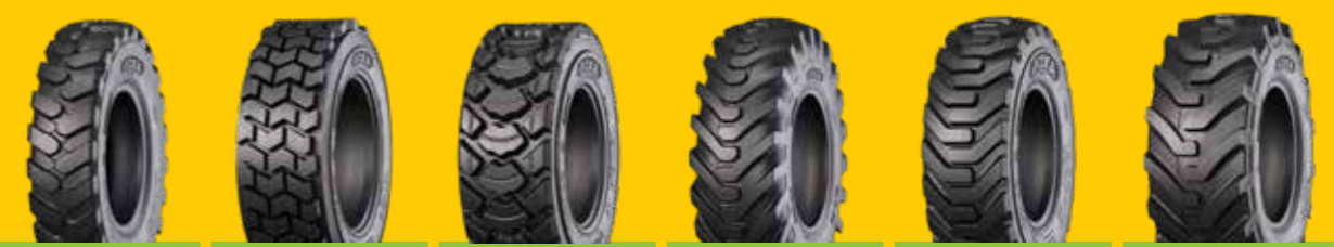
KNK44 KNK65 KNK66 IND80 IND85 IND88