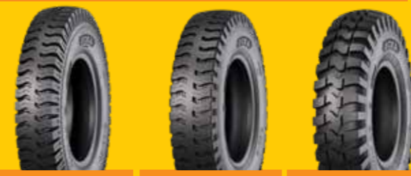
KNK22 KNK25 KNK26