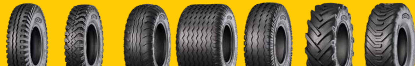
KNK27 KNK28 KNK42 KNK46 KNK48 KNK52 KNK56