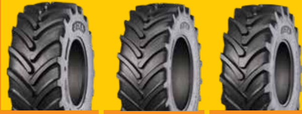
AGROLOX AGRO10 AGRO11