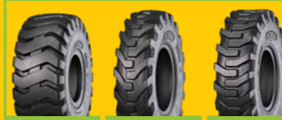
KNK70 KNK72 KNK74