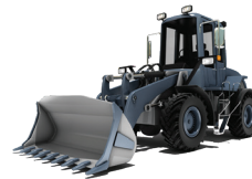
COMPACT WHEEL LOADERS